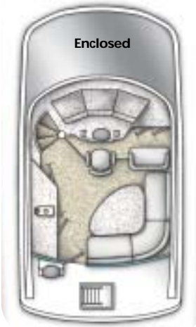
70 SUPER SPORT BRIDGE