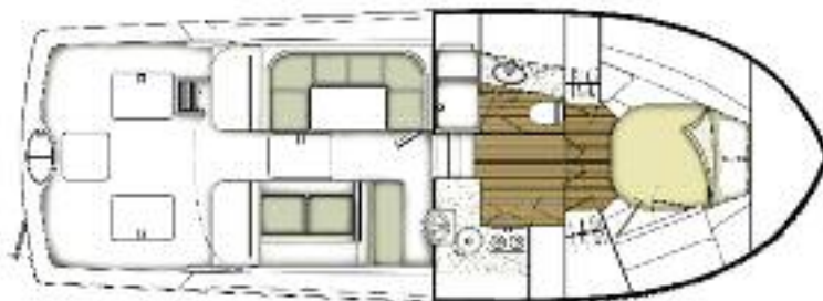
HELM DECK - OPTION B - CENTERLINE BERTH

*Generator is not intended to supply power for all standard and optional accessories. Load must be limited to generator output rating.